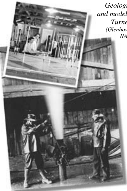
Blowing gas to reduce pressure at Turner Valley

Technology developed in Canada gave the worldwide petroleum industry improved methods for drilling, sour gas production, and sulphur recovery. Canadians redefined the industry's boundaries by opening new frontiers like polar exploration and oil sands extraction. Importantly, Canadians also exported a sense of responsibility for the resources that their technology mastered. Oil-producing nations around the globe are adopting conservation initiatives and environmental technologies that began in Alberta as early as the 1930s.