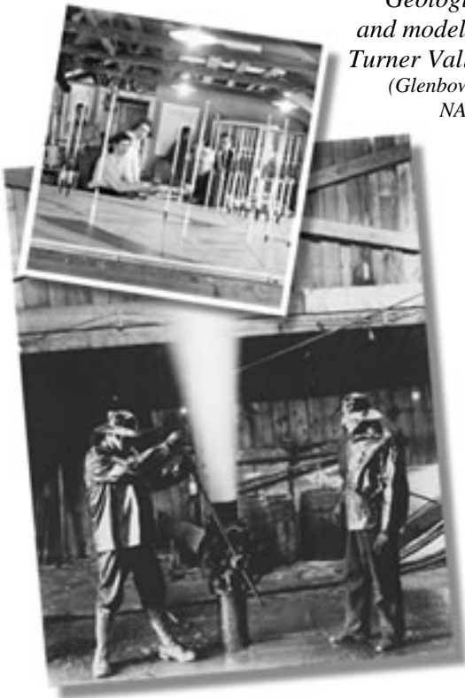
Blowing gas to reduce pressure at Turner Valley 1927